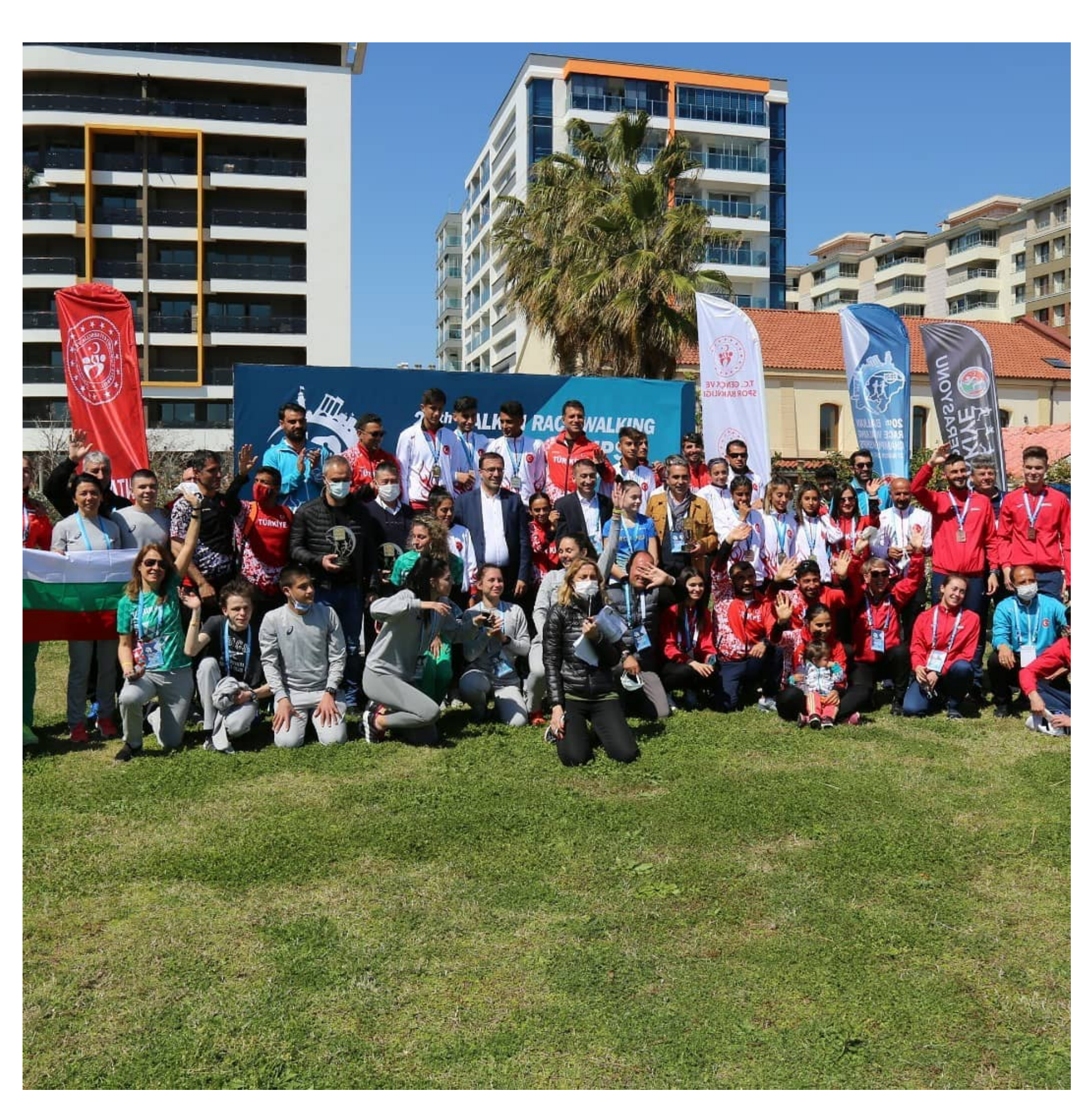
Man Leads Woman Follows Everyone Wins Pdf Download